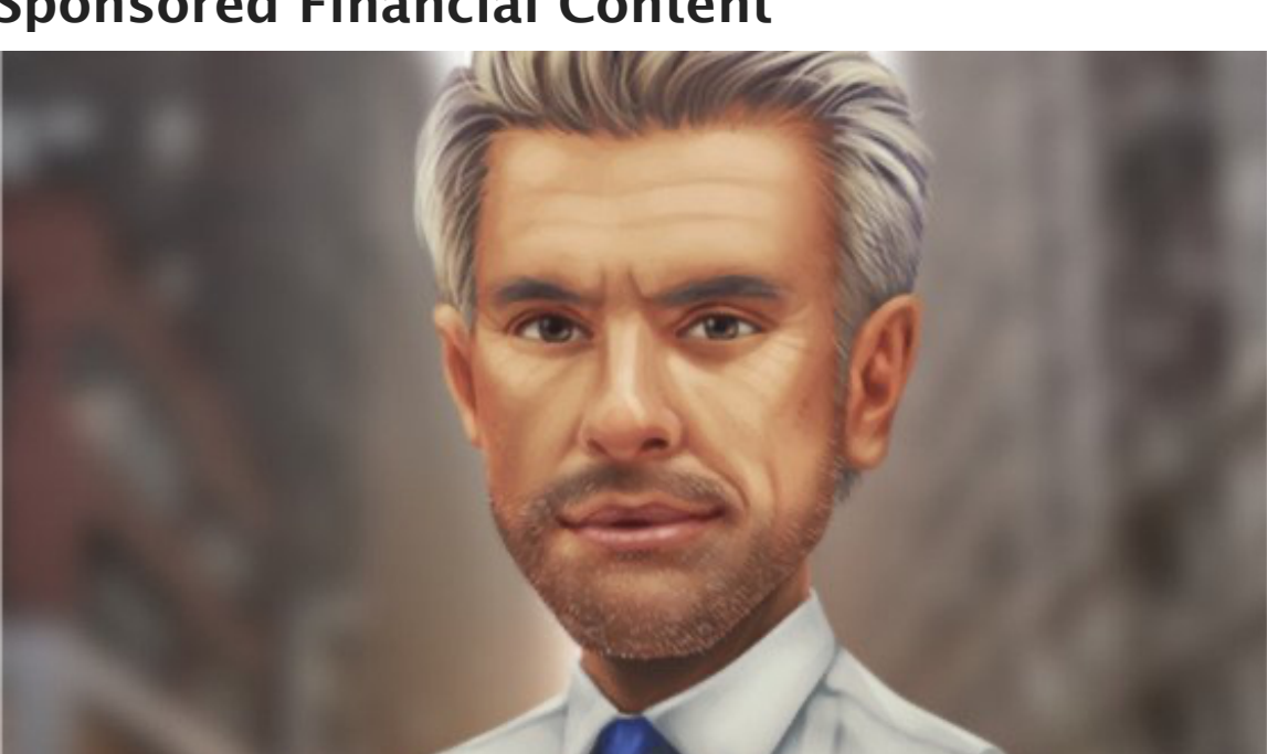
How Far Does Õ1 Million Go in Retirement?